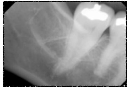
2D Diagnostic Radiograph indicating insignificant presence of resorptive defect superimposed by cortical bone.